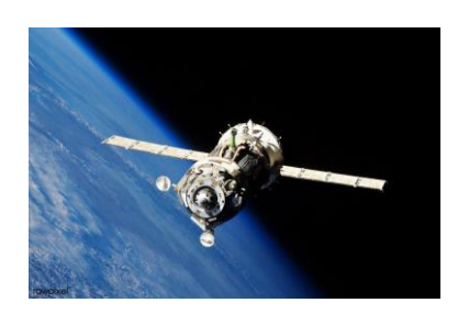
Protect our astronauts

Explore data search, retrieve, inference