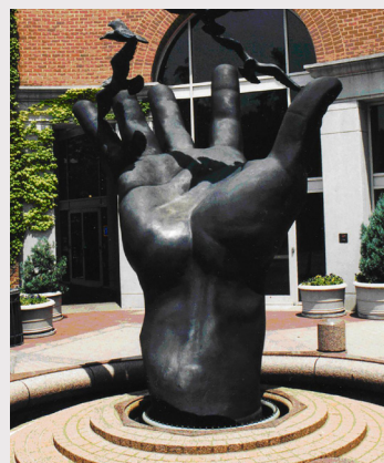
Silver Spring, Maryland