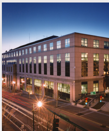
Asheville, North Carolina, Headquarters